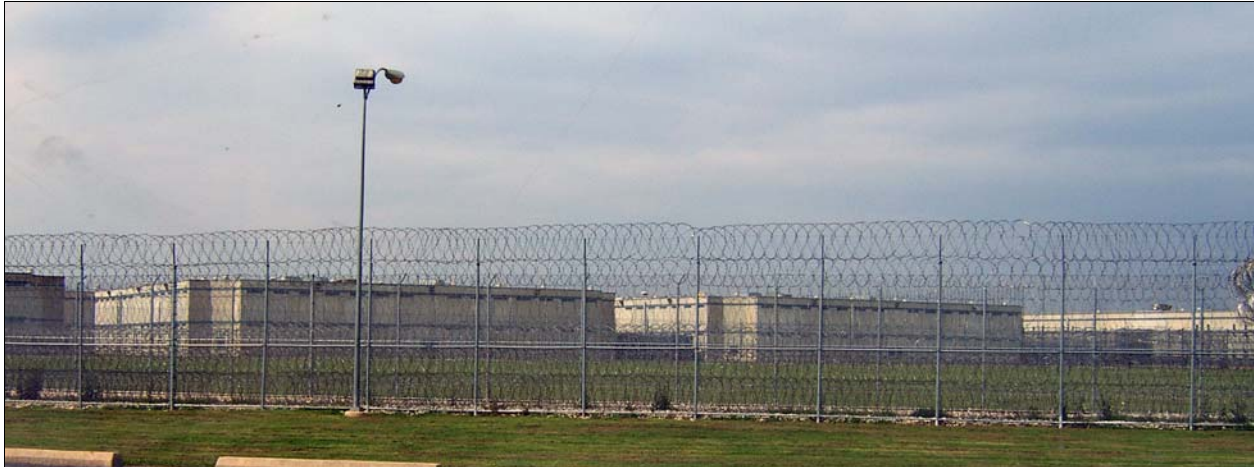
Death Row Pods, Polunsky Unit, Livingston.