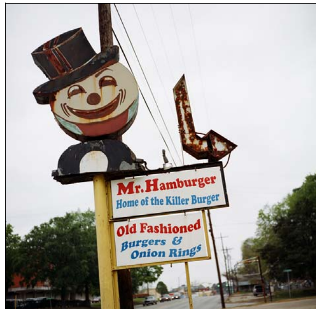
Across the street from the Execution Chamber, The Killer Burger, specialty of Huntsville.

To read previous issues, visit: http://www.abolition.fr/ecpm/french/article.php? sujet=166