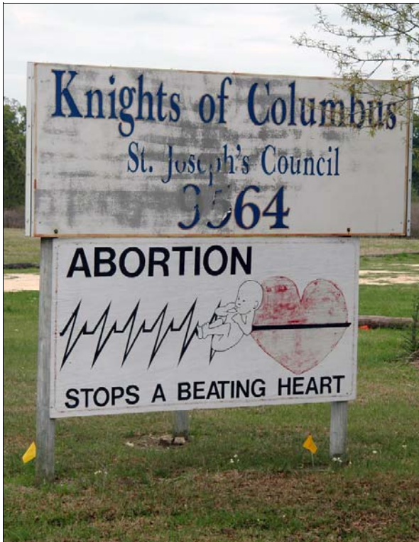
Across the road from Polunsky Unit.